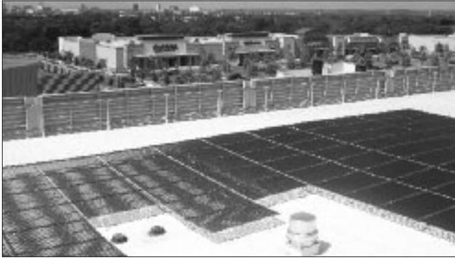
The 23.4 kW cylindrical module installation on the roof of Strictly Pediatrics, a pediatric medical and surgical subspecialty center in the Mueller development.

The H-E-B project represents Austin's first grocery store and largest retailer to use solar power. In addition to the array design and installation, Meridian Solar also installed a monitoring system that displays on a large LCD